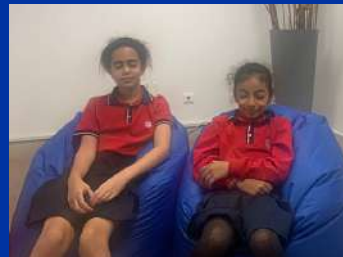
Meditation session for year 5 girls.