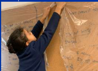
Writing a stress then peeling it off to relieve anxiety.