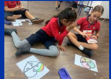
Group coaching session for year 4.