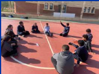
Discussing bullying as a result of different familial setup