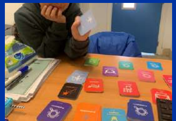
Cards question game focusing on the sense of belonging.