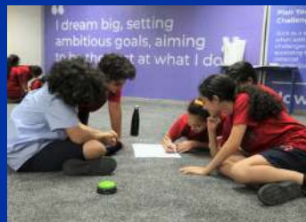
What we have in common, group coaching session