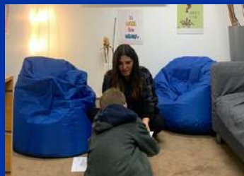
One 2 one coaching session for primary student.